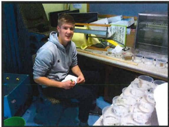
Level 3 Biology Field trip to Marine Centre